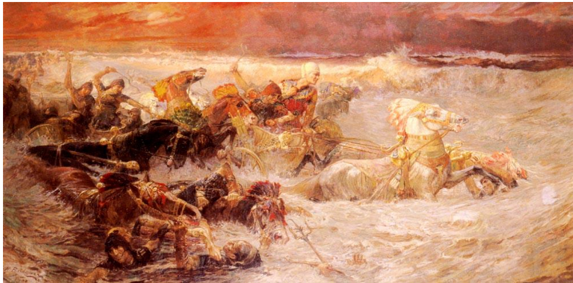
Pharaoh's army engulfed by the Red Sea, oil on canvas, by Frederick Arthur Bridgman

Write the responses on the top third of the paper marked: WATER IN THE BIBLE